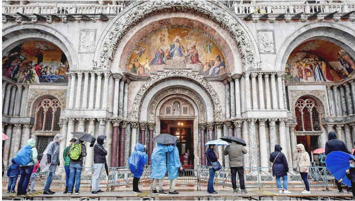
Waiting for a boost.