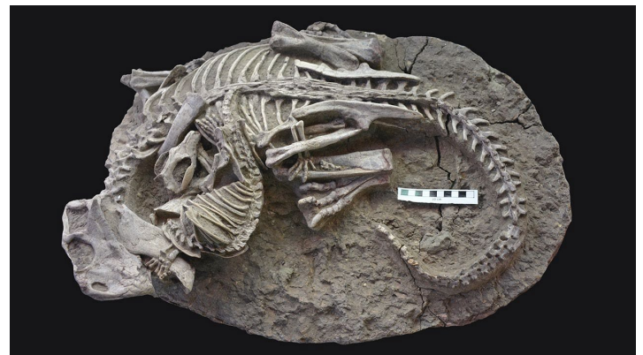
A fight, interrupted.